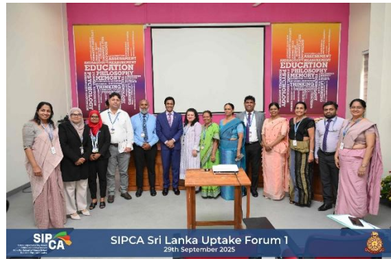
SIPCA Sri Lanka Uptake Forum 1 29th September 2025