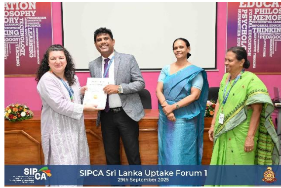
SIPCA Sri Lanka Uptake Forum 1 29th September 2025