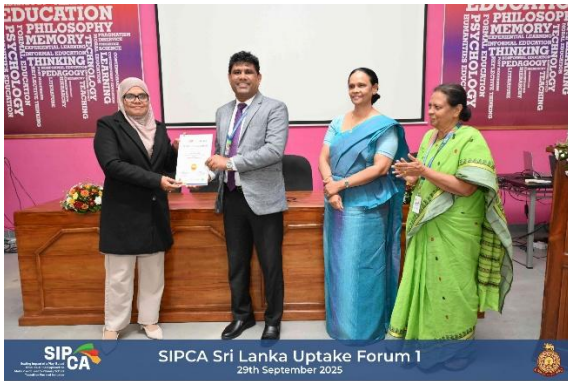
SIPCA Sri Lanka Uptake Forum 1 29th September 2025