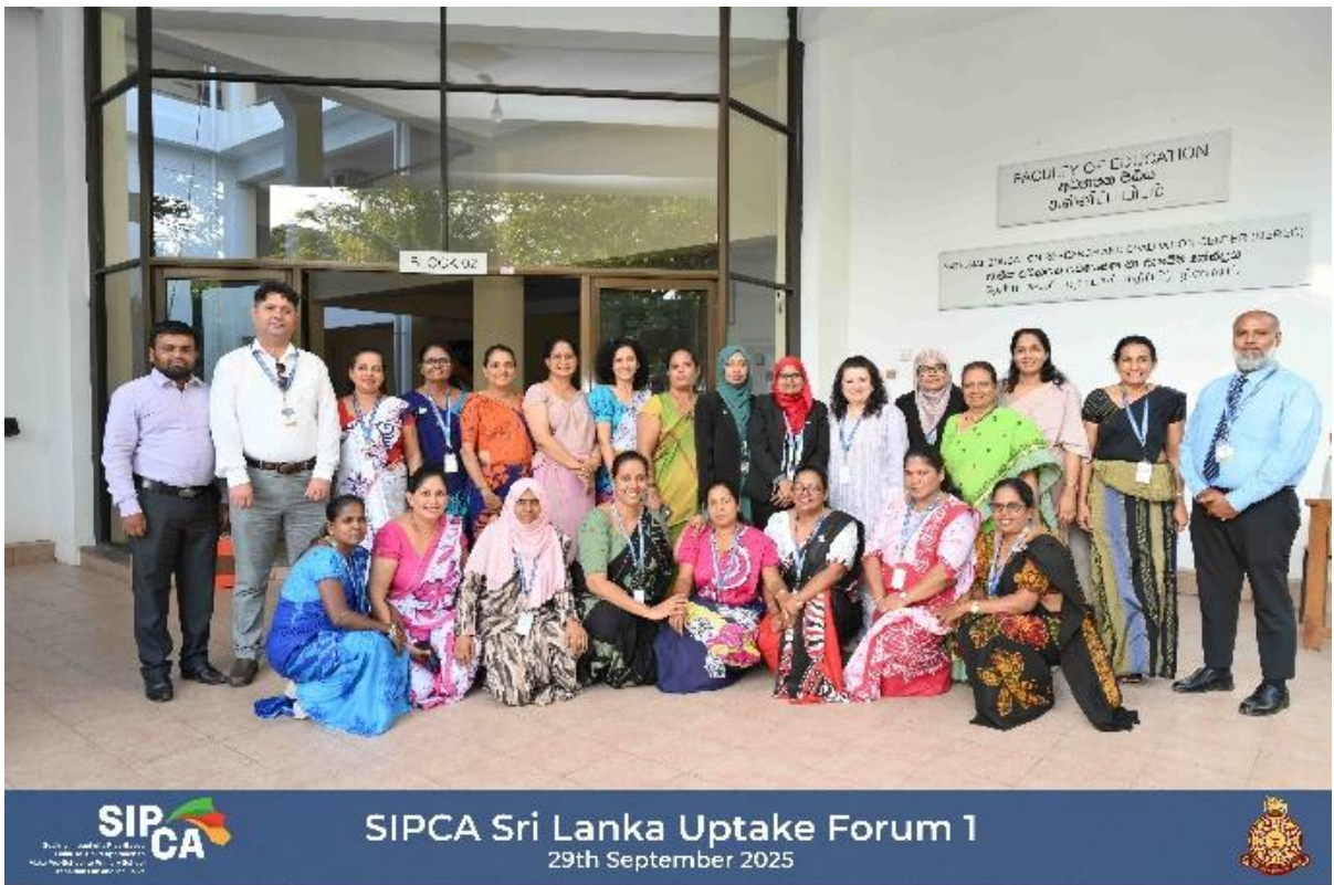
SIPCA Sri Lanka Uptake Forum 1 29th September 2025

Faculty of Education University of Colombo No. 94, Cumarathunga Munidasa Mawatha, Colombo 03, Sri Lanka TP: +94 (0) 11 2588812 Fax: +94 (0) 11 2596888