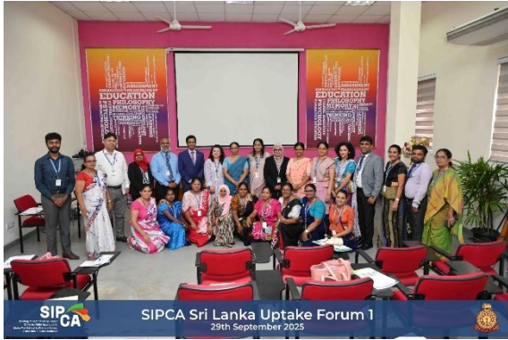
SIPCA Sri Lanka Uptake Forum 1 29th September 2025